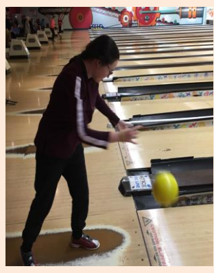
Bowling in Leisureplex Tallaght