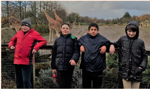
Our trip to Dublin zoo.