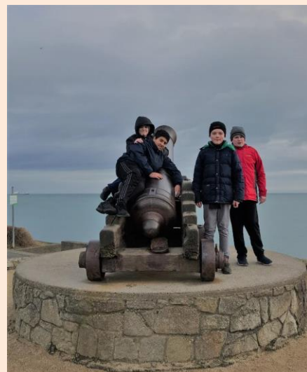
Our trip to Dún Laoghaire